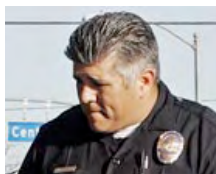
PHOTO GALLERY 8 people shot at bus stop